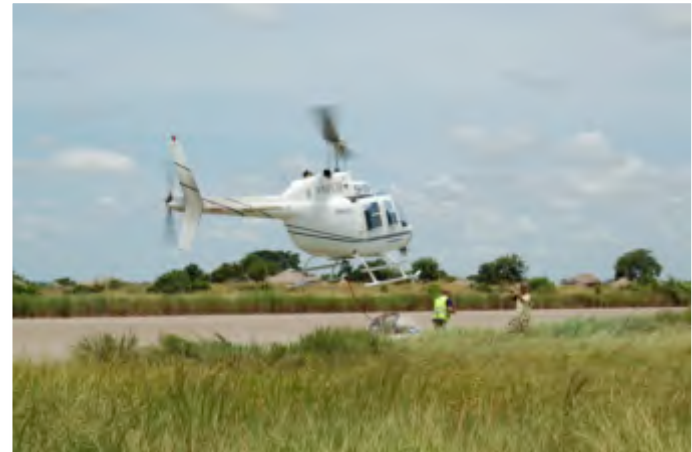
Photo shoots, safaris and water sports are all extremely popular and our experienced pilots will happily suggest an itinerary to you, based on their knowledge of the area. Safety permitting you could even, say, visit a remote spot by helicopter for a picnic lunch that is miles from anywhere. A helicopter gives unbeatable freedom.

To find out more, please email info@WingsLikeEagles.net